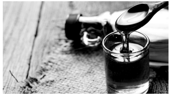
there are those who prefer using honey,