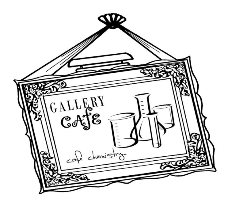
"Café Chemistry" a jerusalem artichoke Contains about 10% protein, no oil, and a surprising lack of starch.